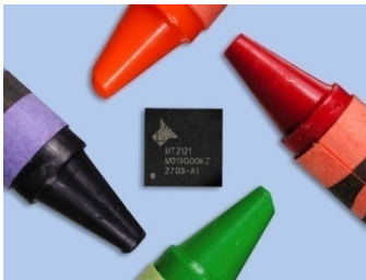
MT2121 Single-Chip Broadband Tuner

The MT2121 has been optimized for high-performance analog and digital cable set-top boxes, supporting the 48 MHz to 1 GHz range of the cable spectrum.