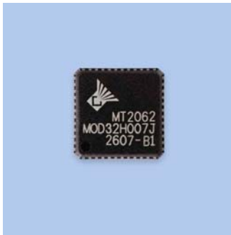
MT2062 Single-Chip Broadband Tuner

The MT2062 is a low-power 3.3 V single-chip broadband tuner with integrated loop-through for all-digital set-top boxes.