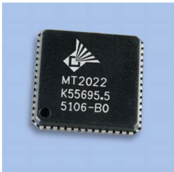
MT2022 Single-Chip Broadband Tuner

The MT2022 is a single-chip broadband tuner designed for superior performance with MoCA systems.