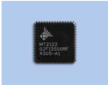
MT2122 Single-Chip Broadband Tuner

The MT2122 is a fully integrated broadband tuner for analog and digital OpenCable set-top boxes, home gateways, cable modems and HDTV applications.