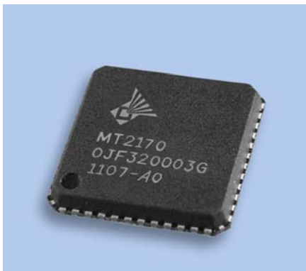
MT2170 Single-Chip DOCSIS 3.0 Wideband Tuner

The MT2170 is a low-power, single-chip DOCSIS 3.0 wideband tuner with an integrated IF variable gain amplifier.